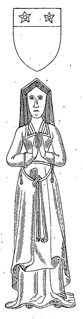
On the floor of Nave. Inscription gone.